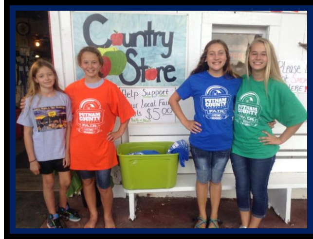
Buy a fair t-shirt at the Country Store