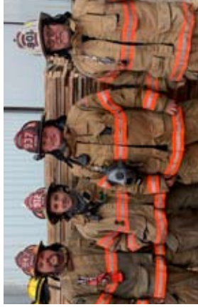
Putnam County Fire Department