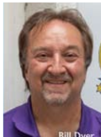
2022 Best of Show Winners